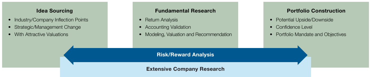
Exhibit 1: Investment Process

Lazard’s investment process is presented here in sequential steps. In practice, the process is neither static nor sequential, but ongoing.